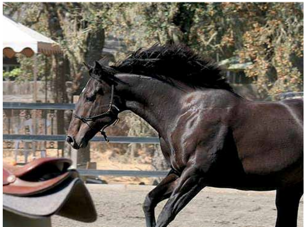
This beautiful horse named Cowboy was rescued when he was 500 pounds underweight. Through the Sonoma County CHANGE program, he was provided all the medications and supplies, supplemental feed, veterinary services and TLC he needed to bring him back to life as you see him here. Read his story inside.

Malnourished and poorly cared for horses can be found even in a country