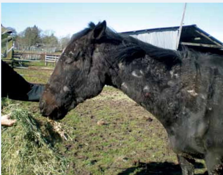
It is hard to imagine that Cowboy was in such a condition, looking at his healthy, recovered state at left.