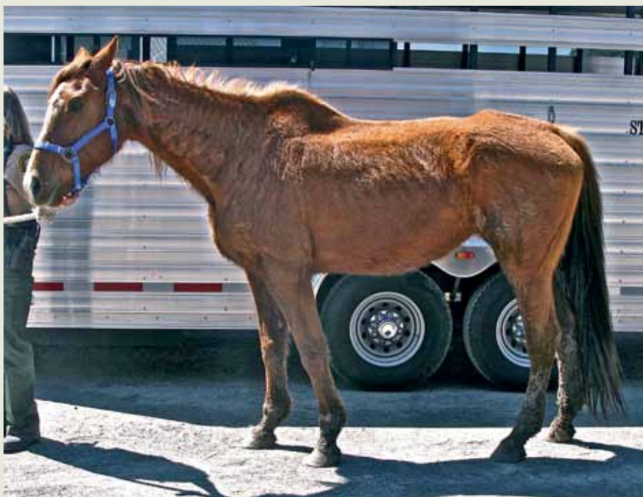
Mindy on Day 1 of her rehabilitation. She was 300 lbs underweight and afflicted with a fungal infection covering most of her body and extensive dermatitis on all four limbs from standing in mud for a long period of time. Can this be the same horse pictured in the left photo?

■ She had a healthy appetite and no episodes of gastrointestinal disturbance throughout the duration of her rehabilitation. ■