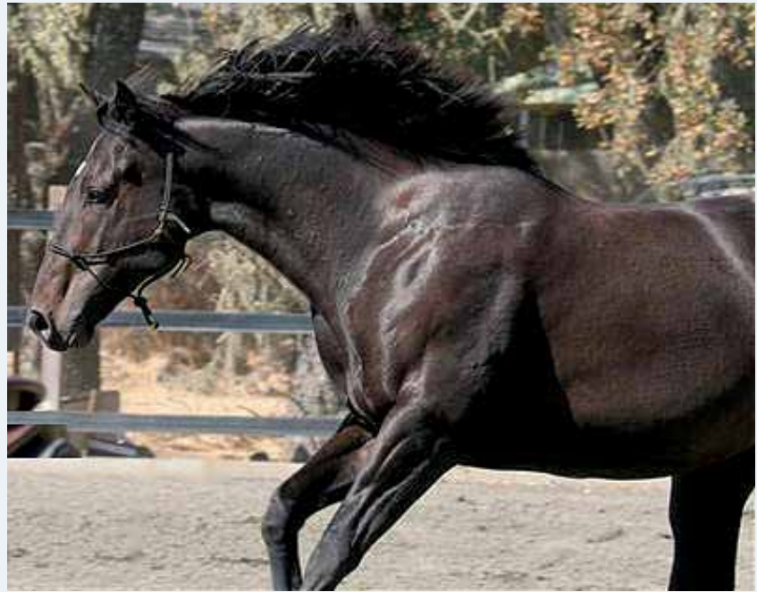
Cowboy after 3 months of rehabilitation.

Cowboy was purchased by a concerned passer-by and taken off the property to a new home. The new owner immediately